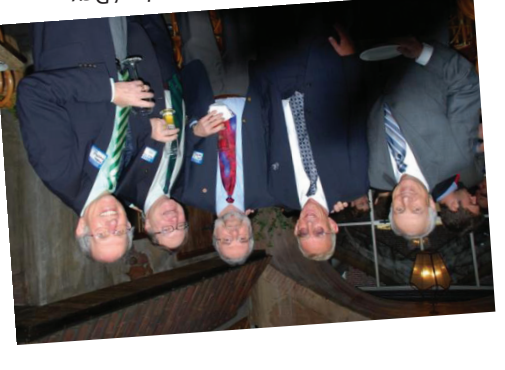
celebration inside! Details of our 2011 Founders' Day